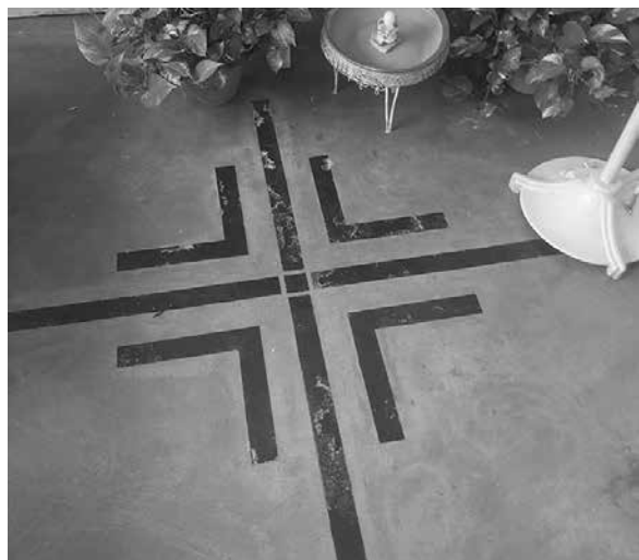
Grey green polished cement floor of front verandah with geometric pattern in black. Photo Vijay Massey 2023.

We were made to observe the original flooring of the front verandah – a grey green of polished cement with art deco patterns in black (French Arts before World War 1); and the rich red oxide drawing room floors with a border in black terrazzo (composite material with chips of stone, marble etc); partitioned rooms, almost cubicles; inventive roofing, made out of inverted concrete troughs (‘khapsel’ type), allowing space for air and creating good insulation; thick brick walls and small exterior openings to shut off the intense summer heat here with natural yet scientific insulation and light; and concealed wiring (a new concept then). The geometrical patterns inspired by nature on the almirahs, doors and small upper storey display the influence of the Chicago-based Prairie School architectural style.