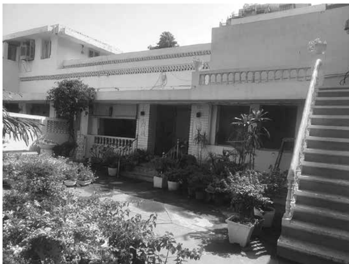
LEFT: Bhatia House and gate post.