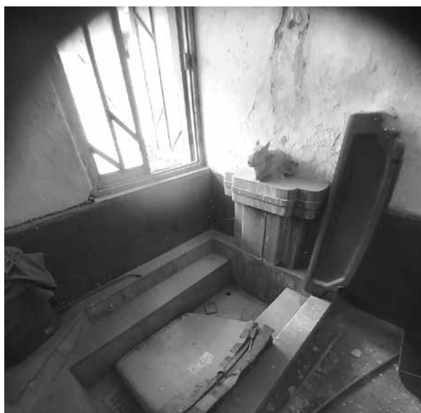
Marble Turkish bath with distinctive Griffin windows. Photo Vijay Massey 2023.